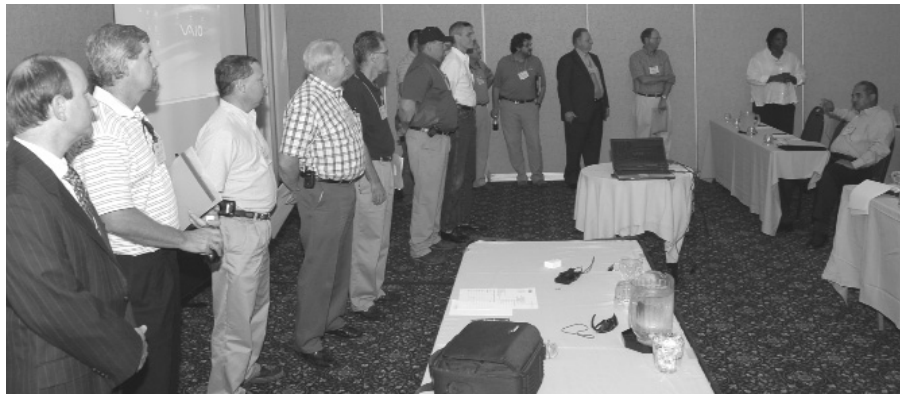
Prime Contractors participating in the TDOT Matchmaking Event.