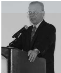
Commissioner Nicely congratulates the Civil Rights Office on the achievements and progress of the TDOT DBE Program and vows to continue his support of the DBE goals set on all TDOT Highway and Road projects.