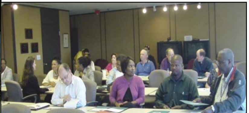
Seated: TDOT, Title VI Liaison's