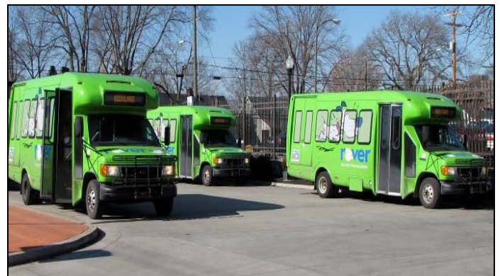
City of Murfreesboro Rover Buses